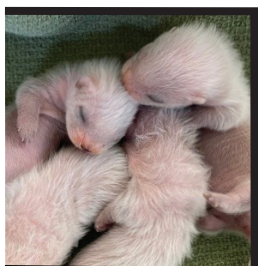
First BFF kits of 2023!

It's an exciting time at your Louisville Zoo as black-footed ferret (BFF) kit season is in full swing. Since 1991, your Zoo has welcomed over 1,100 kits, playing a vital role in the recovery of this endangered species once considered extinct. Every autumn, we look forward to the release of these precious kits back into their native Great Plains habitat.